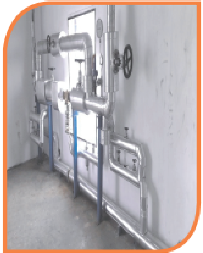
2. Steam Piping